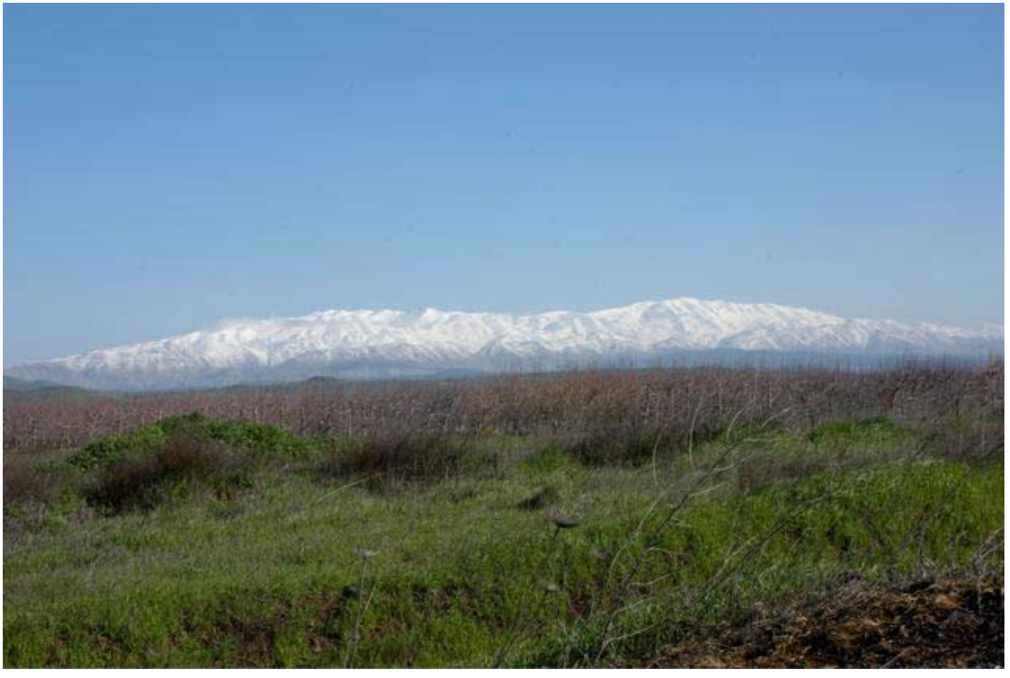
Mt. Hermon from the Golan Heights

I decided that I had to head up into the Golan to get pictures of this fantastic site. From the Bethsaida overlook I got an unobstructed view. But as I drove further north I was able to get stunning views.