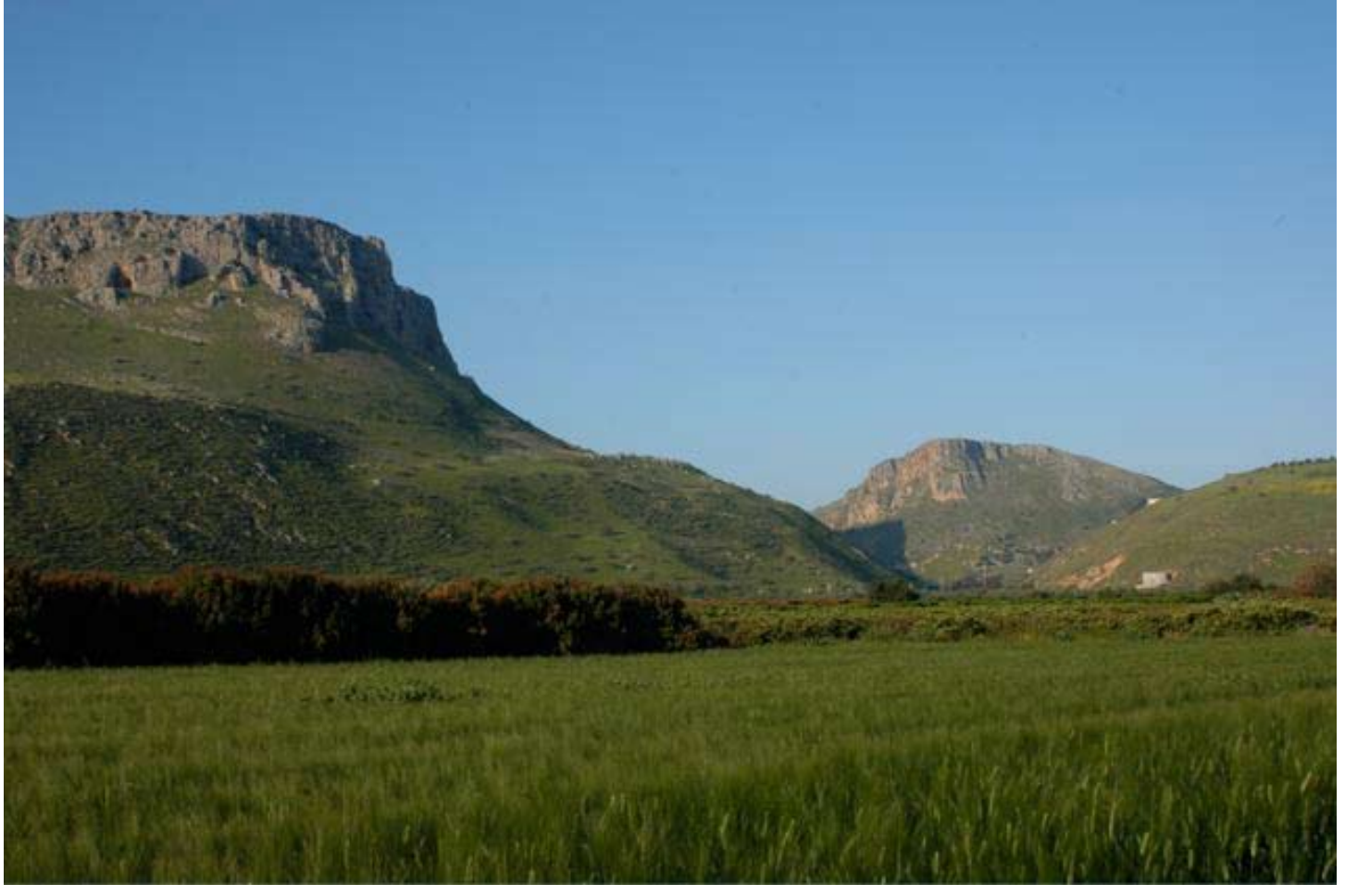
Arbel Cliff at Migdal (Magdala)

As I left for the Golan Heights and an unobstructed view of the mountain I passed by the Arbel Cliff at Migdal (Magdala) Junction. I have never seen this area so green and clear.