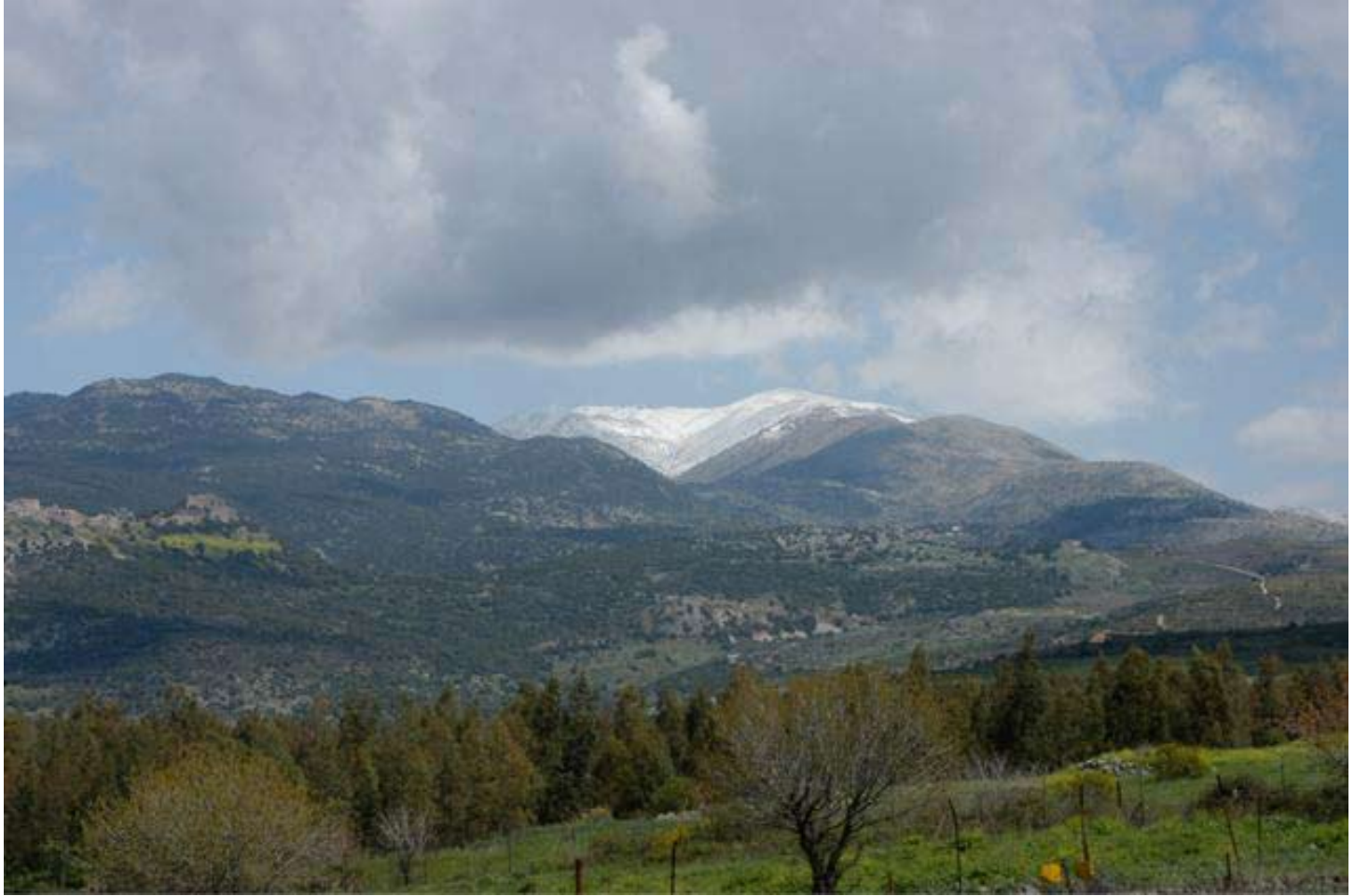
View of Mt. Hermon from Banias

I decided to drive the road marked on the Israel Map as "dangerous road" along the ridge of the Hula Valley. While this gave spectacular opportunities for filming the Hula valley, it also provided an opportunity for me to pay the $400 deductible to the Rental car agency. While driving on a dirt side road I got stuck on a rock. Since I was by myself I put the car in reverse and tried to push off the rock using my right foot to work the gas and my left foot to push on the ground. When the car came off of the rock it lurched backwards and caught the door on a fence. The cheap rental car's door was destroyed and the flimsy fence was fine.