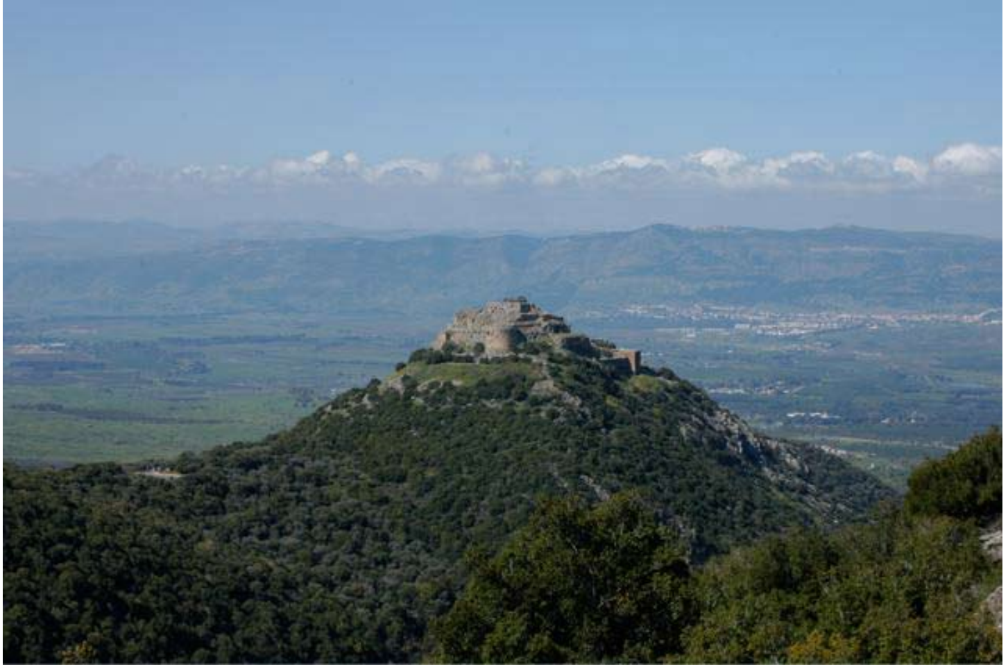
Crusader Fortress "Nimrod's Castle"

Then I came down to Nimrod's Fortress. Of course the site has nothing to do with Nimrod of the Bible. It was built as a crusader fortress and dominates the area around Caesarea Philippi.