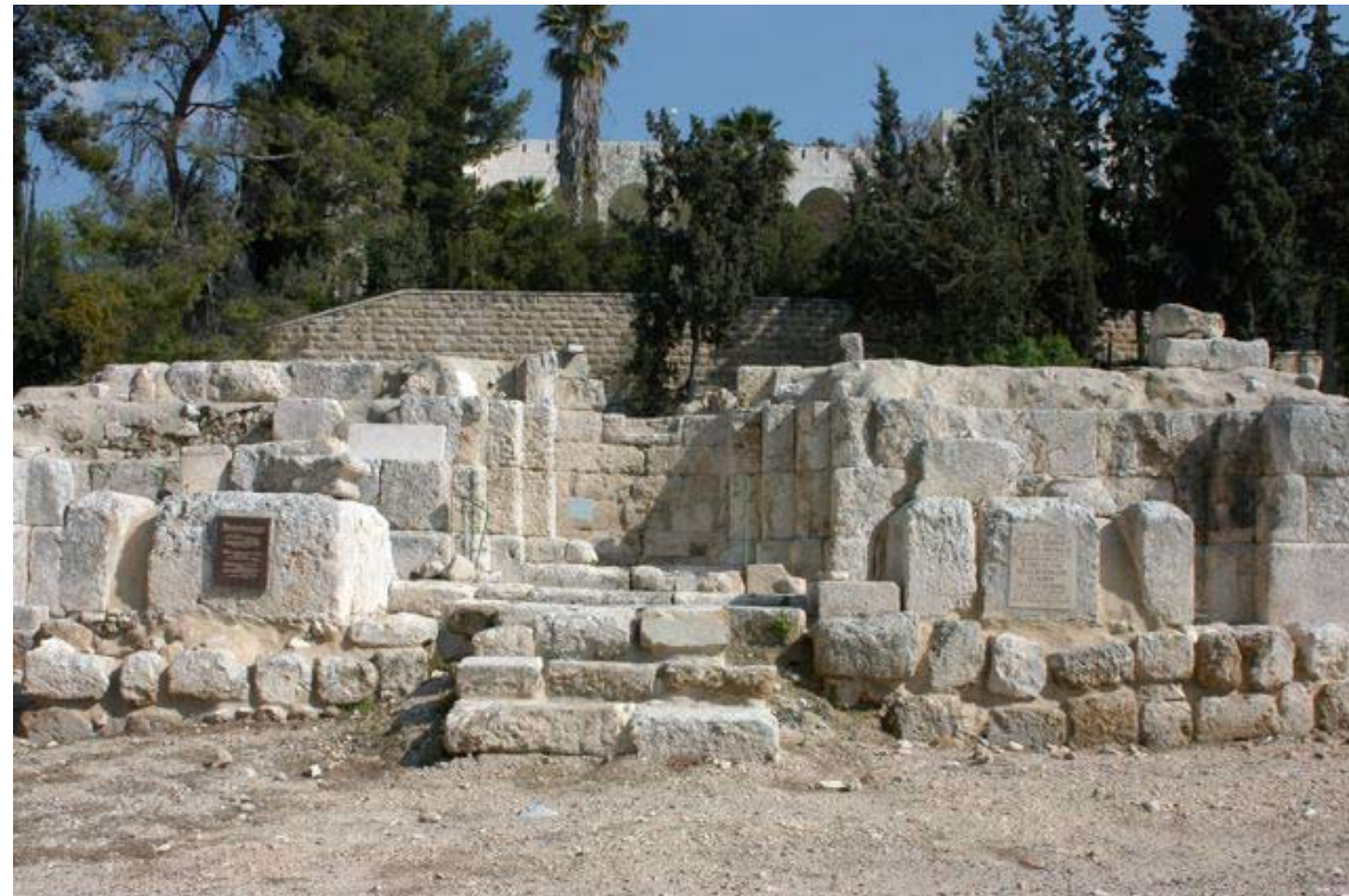
Byzantine Church at Emmaus Nicopolis

I have been putting off writing the episode on the resurrection and the events surrounding it. Jerusalem is very crowded and noisy so I planned to do part of the teaching from Emmaus where it might be quieter and easier to control. The problem is there are three different candidates for Emmaus. I had not taken time to research which Emmaus to use. On this trip I stopped at Emmaus Nicopolis which has been identified as the site since early Christian times. Here you can see the ruins of the Byzantine and Crusader Churches.