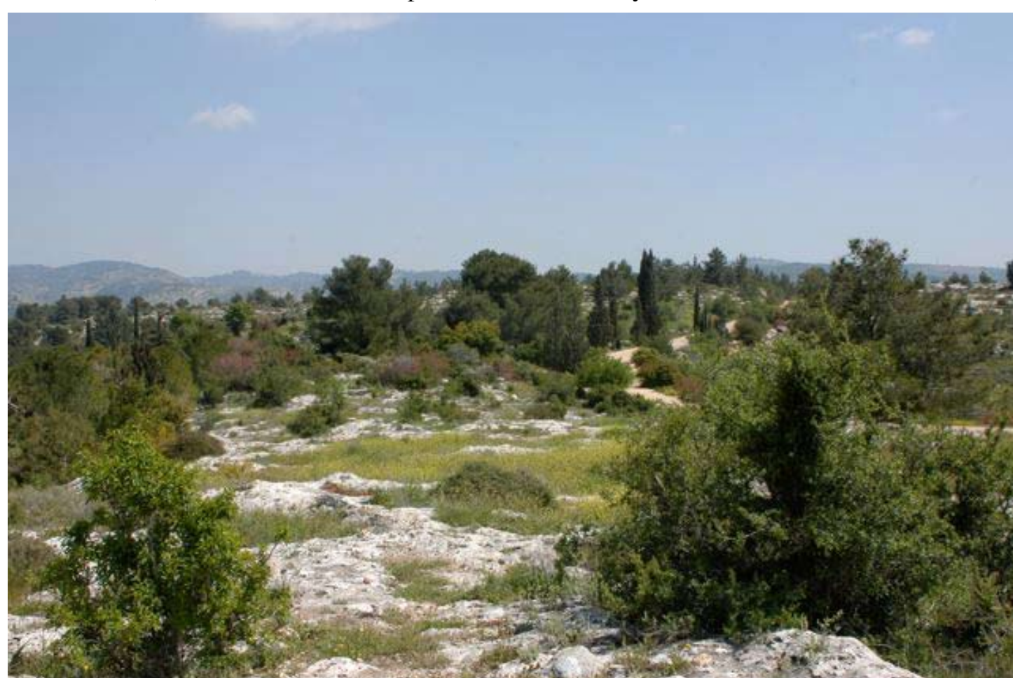
Park near Emmaus Nicopolis

Whether this is the actual site or not, this beautiful park lying between Emmaus Nicopolis and Jerusalem will make a wonderful (and quiet) setting to teach about the events surrounding Jesus resurrection, including the walk to Emmaus with Cleopas and his companion. The park is extremely large and I entered it without a map (I must confess that I spent a lot of time trying to locate the exit). Now I can write this episode with this lovely view in mind.