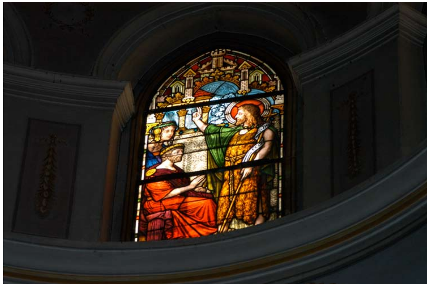
John the Baptist before Herod, En Kerem