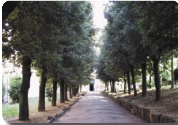
Chapel of the Three Fountains

His last letter is generally believed to have been written to his dear friend and son in the