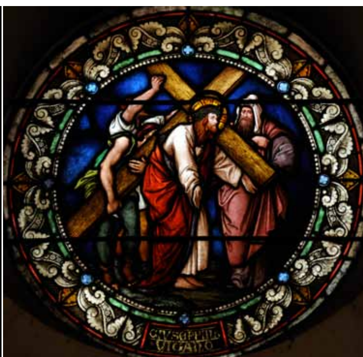
Jesus Carrying His Cross

Each Friday afternoon the Franciscans lead a procession down the Via Dolorosa to the Church of the Holy Sepulchre. The tight streets are jammed with tourists and pilgrims so filming here is quite a challenge. The buildings block out the sunlight creating great contrast with the blue sky and making it very difficult to film.