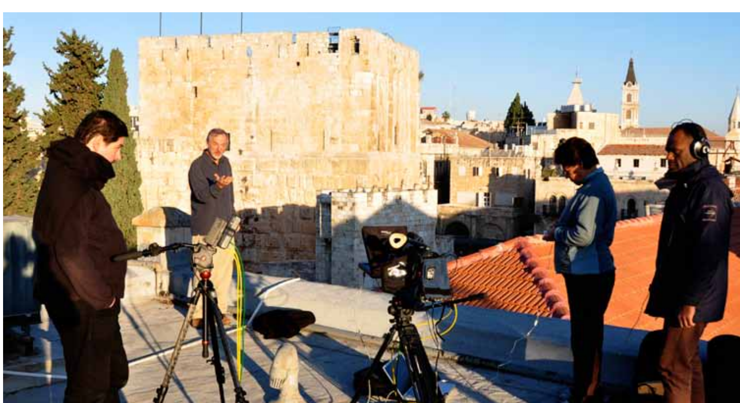
Filming from the roof of Christ's Church Guest House

We wanted to tell the story of Jesus before Pilate using the Citadel as a background. Since this is near one of the busiest gates of Jerusalem, it was a real challenge. Inside of the old city, across the street is Christ's Church, the oldest Protestant Church in the land. This was the site of the British Embassy in the 19th century and some of the buildings have been converted into guest houses. After praying, I went in and asked to speak with the management. The manager kindly gave permission to film from their roof top which is directly across from the citadel.