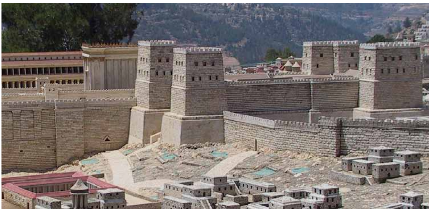
Model of Antonia Fortress and Temple

It was thought for centuries to be the location of Pilate's Judgment hall and is the location of the first two stations of the cross for the Franciscans. The first station is located at the modern Muslim school for boys that stands on the former site of the Antonia which was destroyed by Titus in 70 AD. Across the street is the Monastery of the Flagellation, with two lovely chapels that commemorate the trial before Pilate and Jesus being beaten before sent out to carry His cross. Brilliant stained glass windows decorate each church.