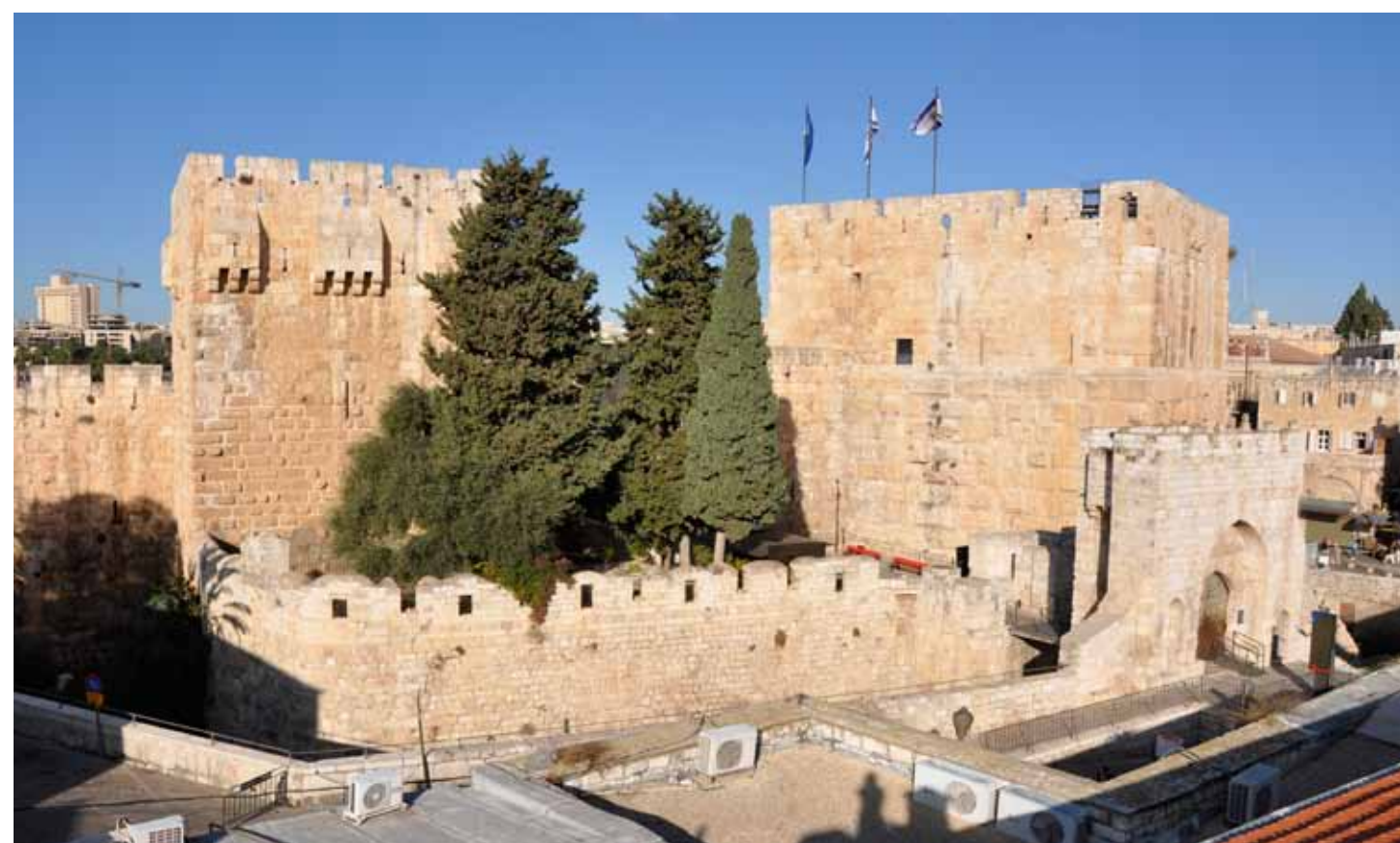
The Citadel next to the Jaffa Gate from Christ Church roof

Finally, on our last Friday in Jerusalem there was cloud cover so we returned not realizing it was the Feast of the Sacrifice for Muslims. It is estimated that over 100,000 Muslims had gathered on the former Temple Mount for the celebration. We completed our shoot after they were dismissed, so it took over an hour to drive our car down the narrow streets through the great throng of people. But, the footage was good and will be used in episodes 24 and 25.