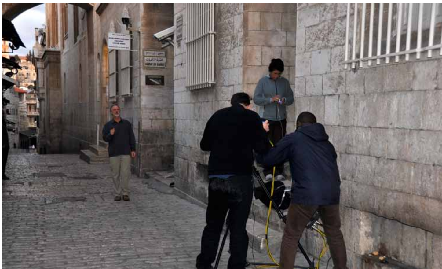
Filming at the Ecce Homo (Behold The Man) Arch at dawn

Dear Friends and Supporters of The Biblical World: