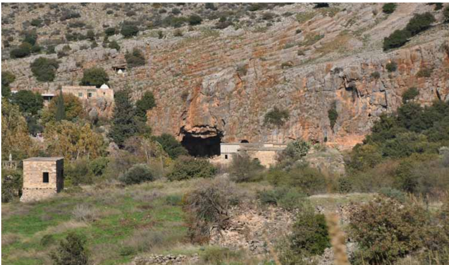
Caesarea Philippi (modern Banias) primary source of the Jordan River where we will film part of Episode 18