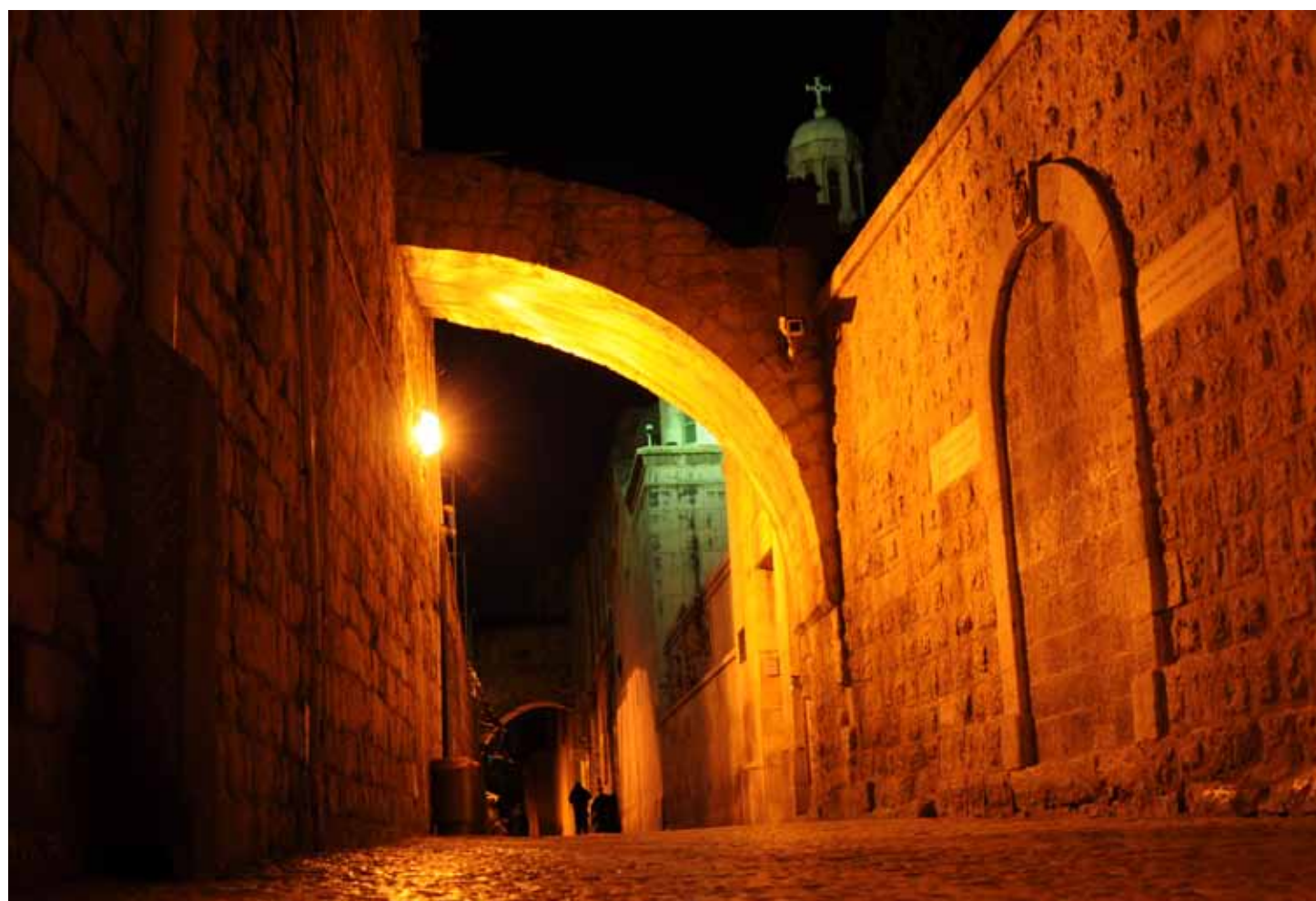
Ecce Homo (Behold The Man) Arch at dawn where we will film sections of Episodes 24 & 25

Report #1 - Tuesday PM November 17, 2009