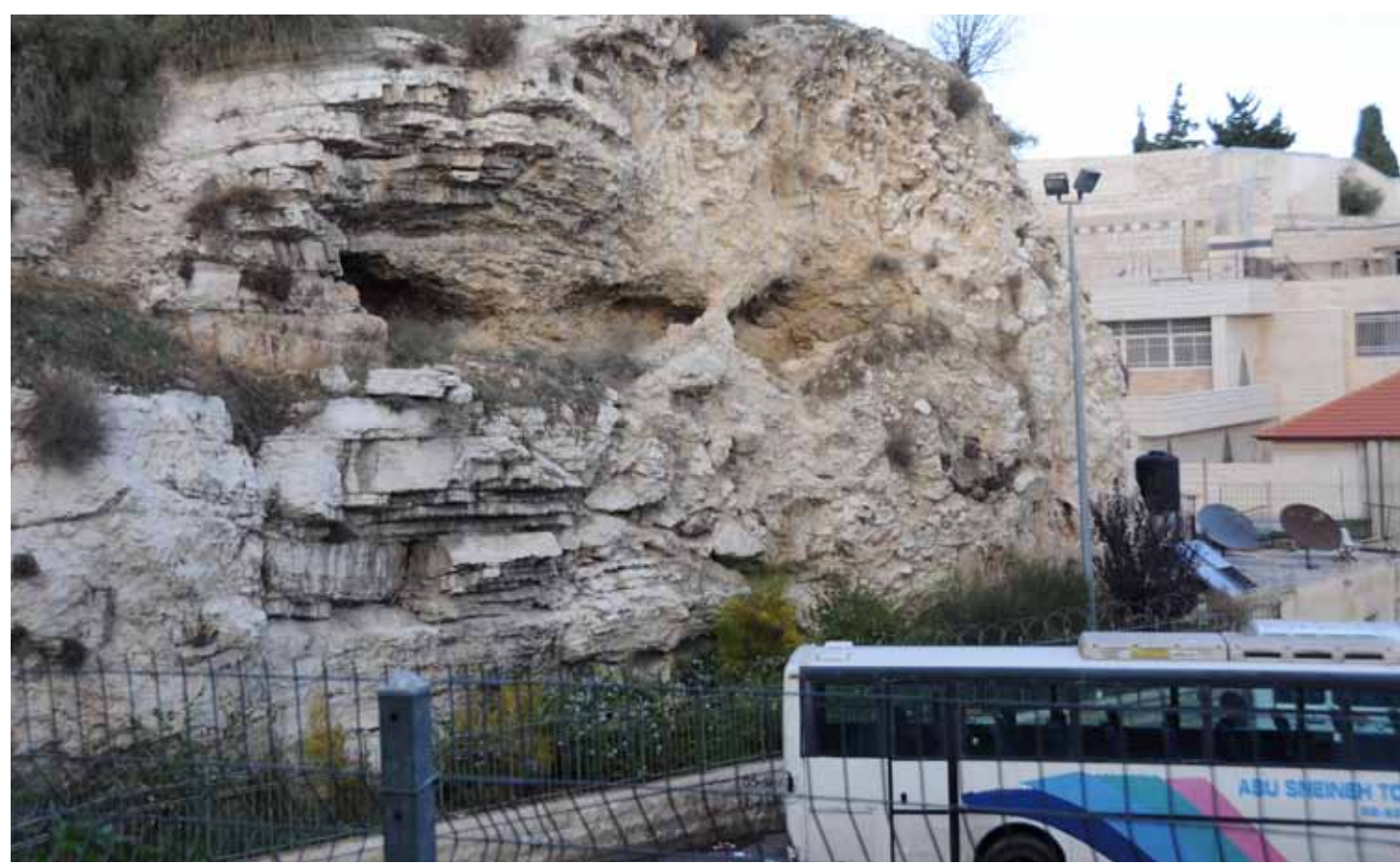
Gordon’s Calvary above Arab bus station where we will film part of episode 25

During this trip we will film an episode on the trial before Pilate and Herod (episode 24), then “The True Passion of the Christ” (episode 25) on the crucifixion. This will be followed by “Was It A Morning Like This” (episode 26), on Jesus burial in Joseph’s tomb and resurrection from the dead. Episode 27 “The Legacy of Jesus” will be set in Emmaus and examine the joy of the resurrection as Jesus appears to His followers. And then we will conclude with episode 28 “Jesus In Jerusalem and Beyond” focusing upon Jesus appearances to the disciples and what He has been doing since His ascension into heaven as our great heavenly priest. This episode will conclude the series by giving a fresh look at John 14 in the context of a first century middle eastern wedding.